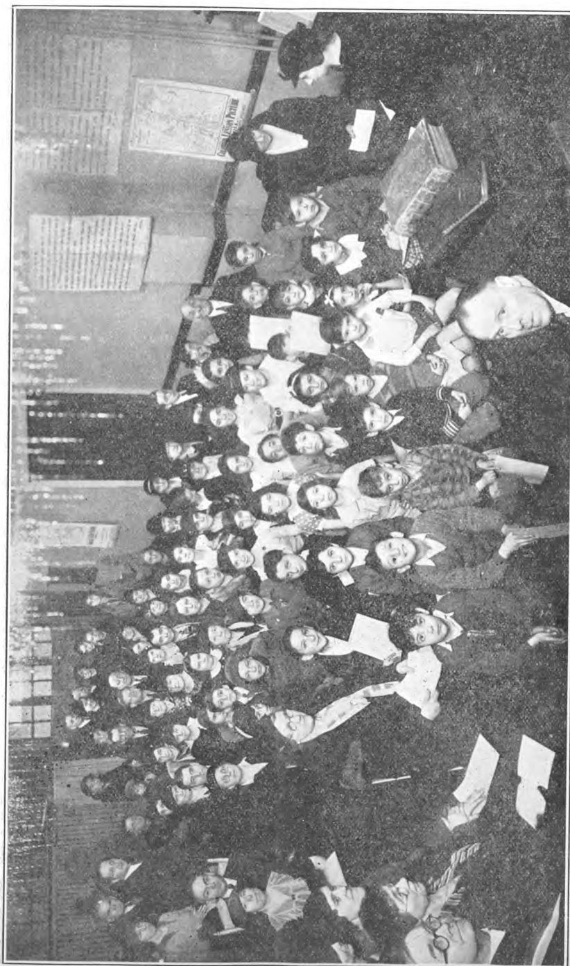
Christmas Celebration in Pittsburgh Branch