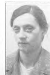
Housewife, 4 children, a struggle to exist.

"Since Christmas I am very sick. My wife too is in very bad health. We and our children are undernourished. We were in a desperate situation. There was no ray of hope for us, when we received a note from the post office to come for a parcel from America. When we unpacked those wonderful things which we have not had for