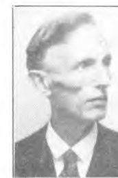
A ghost of his former self.

Every letter of acknowledgment from our Hebrew Christian brothers and sisters tells the same story, the story of dire need, hunger and freezing, but also the story of answered prayers, praise and gratitude, when help in the form of a food package from America arrives. I could easily fill the whole issue of our beloved paper, THE CHOSEN PEOPLE , with letters from our Jewish Christians in Germany; but since I have only a limited space at my disposal, let me bring here a quotation from just one more letter.