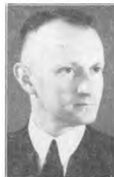
Once a Police Captain, now a skeleton.