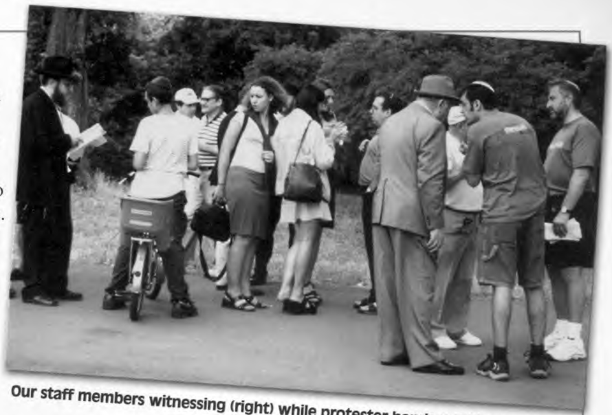
Our staff members witnessing (right) while protester hands out literature (left)

On the day of the event, about fifty protesters from a number of Jewish organizations gathered as well. Still,