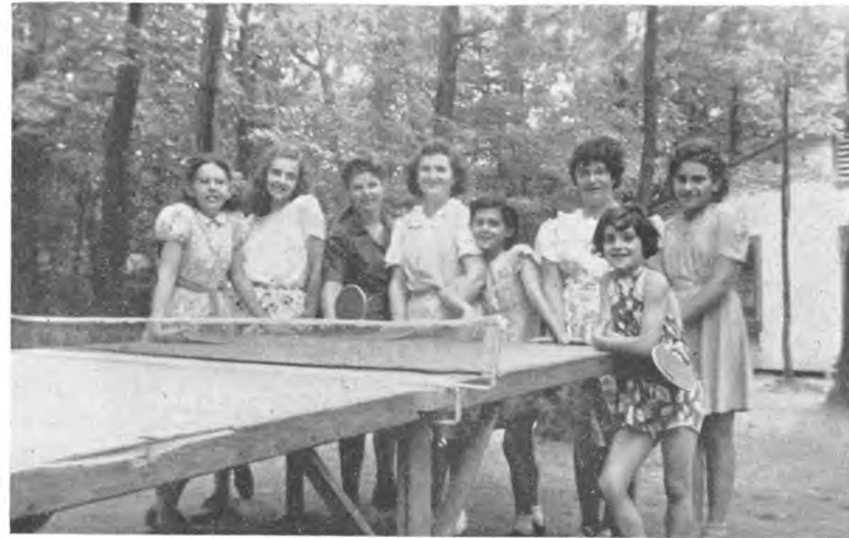
HAPPY DAYS AT CAMP HANANEEL

times. As the sacrifices, laws and ordinances were mentioned the girls saw that now no longer could one be truly Jewish in that sense. "So what can we do?" was the natural question. The answer pointed to the One who fulfilled the Law and the Prophets and brought in the New Covenant—the completed Judaism."