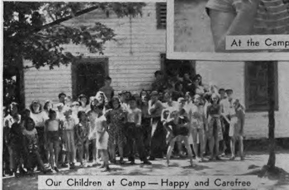
Our Children at Camp — Happy and Carefree