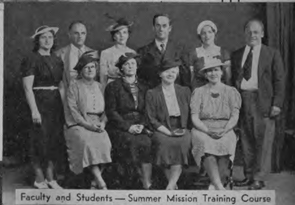
Faculty and Students — Summer Mission Training Course