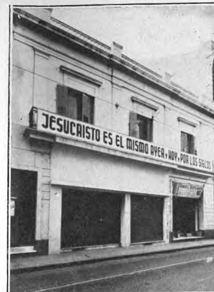
AMERICAN BOARD OF MISSIONS TO THE JEWS, BROOKLYN, N. Y. MISSION STATION, BUENOS AIRES

The compound of my reminiscences was accepted with consid-