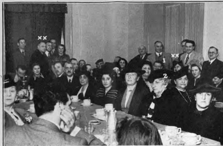
FIRST GATHERING IN OUR BUENOS AIRES MISSION