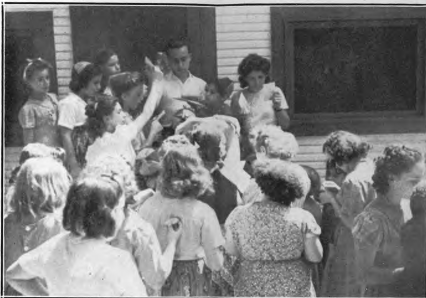
THE EXCITING HOUR OF THE DAY. "IS THERE A LETTER FOR ME?"

THROUGHOUT the winter months our children were continually inquiring, "Are we going to camp this summer?" Because we could not give a definite promise, we had to keep the children in suspense. All during the Spring we prayed earnestly that God would reveal His plan for the summer. "The Lord is nigh unto all them that call upon Him." In May we received our answer that we were to take the girls and boys to Camp Hananeel, Stony Brook, Long Island, for three weeks in July.