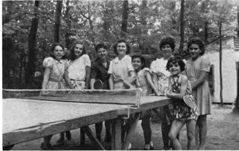
HAPPY DAYS AT CAMP HANANEEL

times. As the sacrifices, laws and ordinances were mentioned the girls saw that now no longer could one be truly Jewish in that sense. 'So what can we do?' was the natural question. The answer pointed to the One who fulfilled the Law and the Prophets and brought in the New Covenant—the completed Judaism."