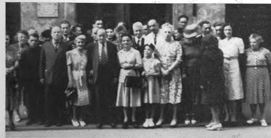
Our Mission in Paris, France, and a group of believers.