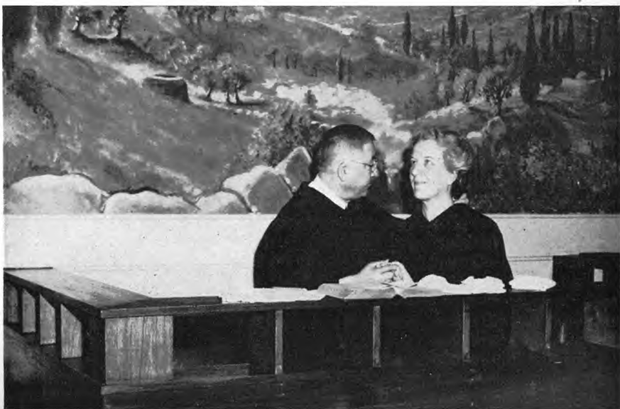
Scene in Baptismal Fount in Headquarters' Building, when 9 Jewish converts confessed their faith in the Lord Jesus Christ, and were baptized.

front rows. As the meeting opened, an impressive silence fell upon the congregation as if eagerly anticipating the special blessing which comes with hearing those of the household of Israel proclaim to all, that they have been redeemed not "with corruptible things, as silver and gold . . . but with the precious blood of Christ, as of a lamb without blemish and without spot." "Being born again, not of corruptible seed, but of incorruptible, by the word of God, which liveth and abideth for ever" (I Pet. 1:18, 19, 23).