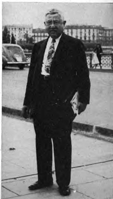
Your General Secretary in Geneva, Switzerland, on his way from Paris to Italy.

As the good ship Queen Mary cat-footed her way cautiously through the New York Narrows, the decks were crowded with wide-eyed tourists, many of them coming to America for the first time; and their awe and marvel seemed boundless. Then suddenly that symbol of man's successful struggle for freedom of soul and conscience, hove into sight, the Statue of Liberty. The sun cast a radiance even through the fog over the diadem that crowned the head of old Liberty, and many a cheek was wet as the tears flowed down in unrestrained joy. Here was a symbol of freedom, a guarantee that human beings will be respected, that the dignity of the human soul will find honor and decency. It was hard to keep the gulp from coming to one's throat. Near me stood three huge husky Irishmen. From their conversation I gathered that they were rather vociferous politicians from the Bronx, here in New York. I saw one of them wipe the tears from his eyes and say