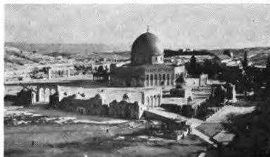
The Temple Area and the Dome of the Rock

THE PLACE where the magnificent Temple of Solomon once stood is no longer in either Christian or Jewish hands. Since the year 1187, when Saladin drove the Crusaders out of the Holy Land the site has belonged to the Moslems. The entire area, called today in Arabic, Al Haram al Sharaf, or The August Sanctuary, has the shape of an irregular rectangle covering about 150,000 square yards. It houses two large mosques, the Dome of the Rock and the Mosque of Al Aksa besides numerous small but historic buildings.