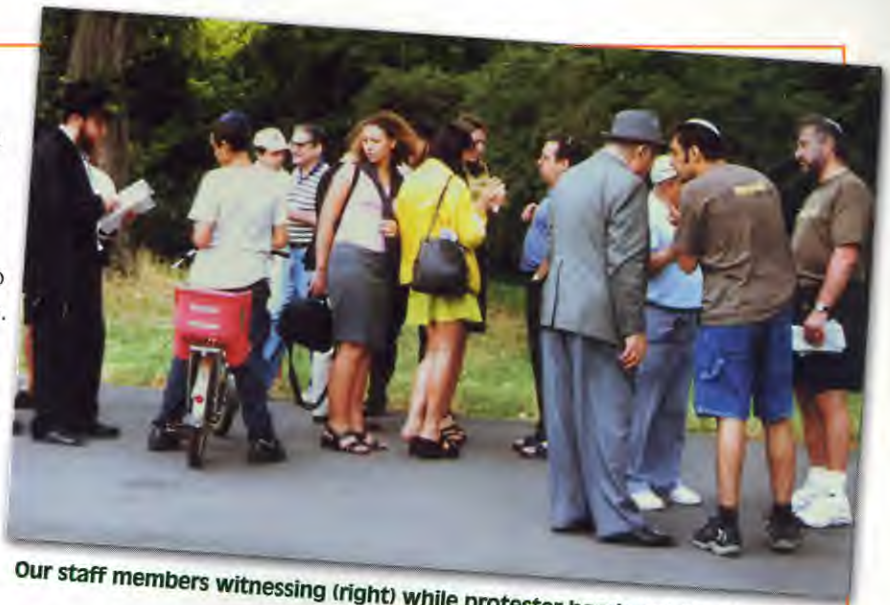
Our staff members witnessing (right) while protester hands out literature (left)

On the day of the event, about fifty protesters from a number of Jewish organizations gathered as well. Still,