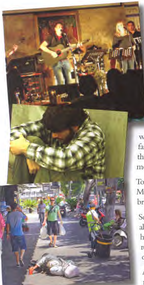
Top: Messianic worship is often led by graduates of the rehab program. Middle and bottom: the streets offer many opportunities for ministry.