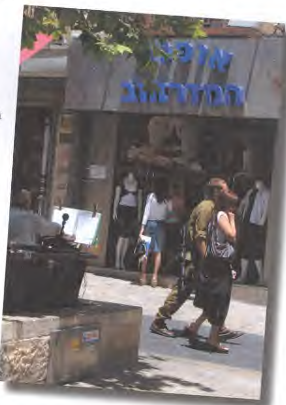
Tel Aviv is a city full of life.

There is no darkness that the light of Messiah cannot penetrate!