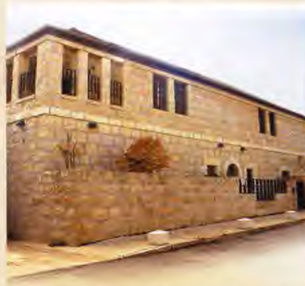
Our Jerusalem Messianic Center

With this in mind, we are kicking off our “To the Jew First” Advancement Campaign in light of entering our 116 th year of ministry. It