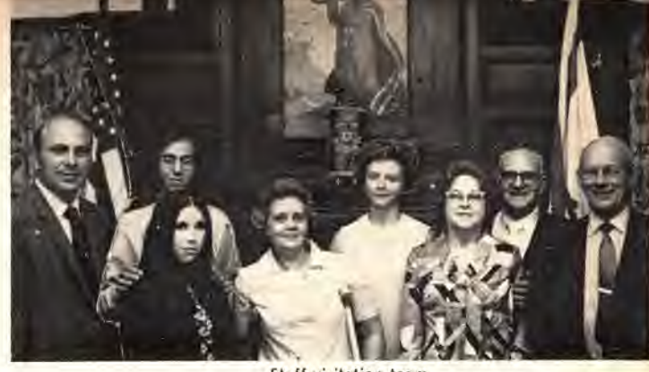
Staff visitation team