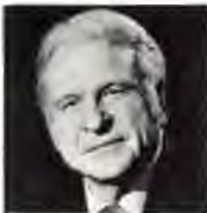
Dr. W. A. Criswell