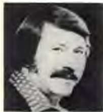
Rev. Hal Lindsey

don't know—resentment. I have a different outlook on life. God is with me all the time, guiding me. ▲