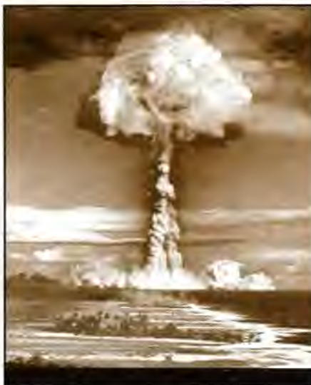
continued from previous page

The story of the Arab's quest for nuclear weapons is not finished. Even as you read this article, Arab scientists are working behind closed doors to produce the ultimate weapon of destruction to use against Israel