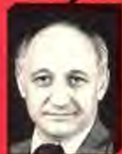
WESTERN USA (including Alaska and Hawaii)