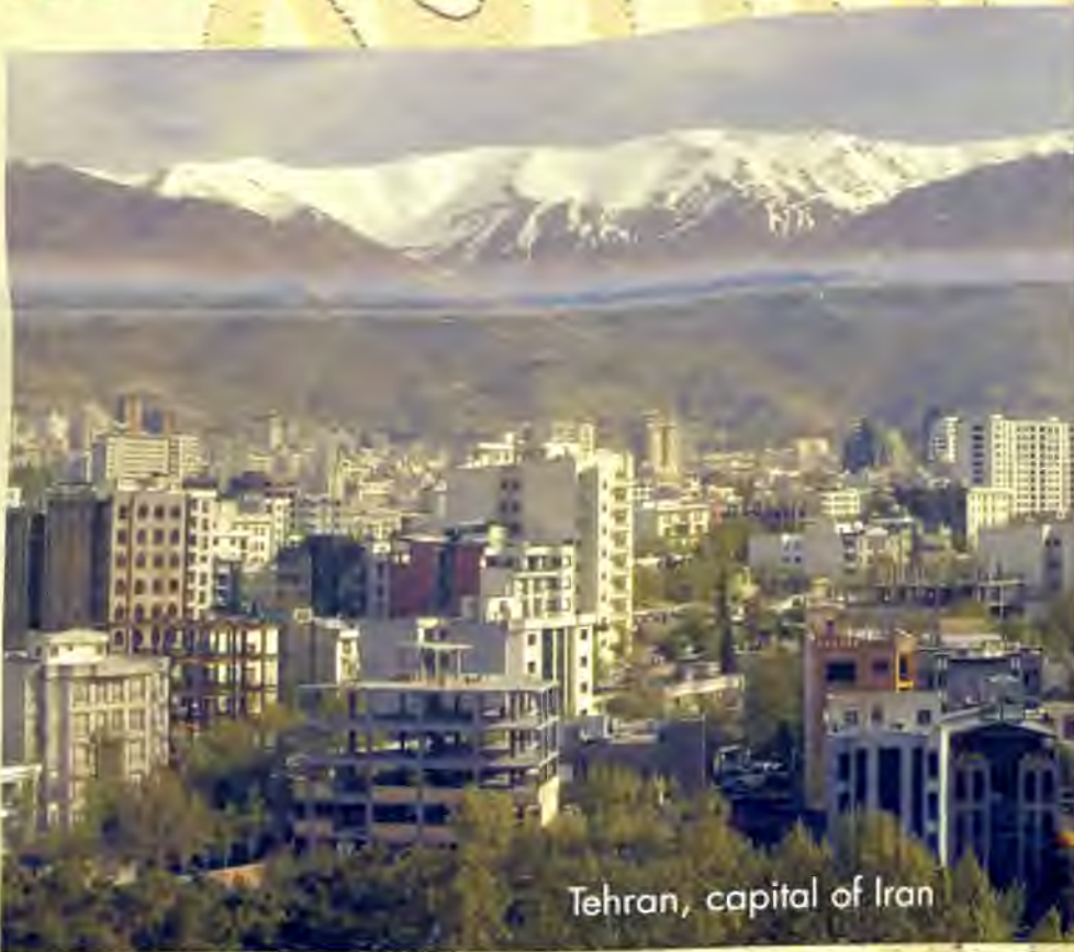
Tehran, capital of Iran

Shalom in the Messiah. Thank you for your prayers and support—they mean so much to the Chosen People Ministries staff.